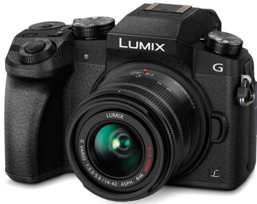
Panasonic Lumix G7