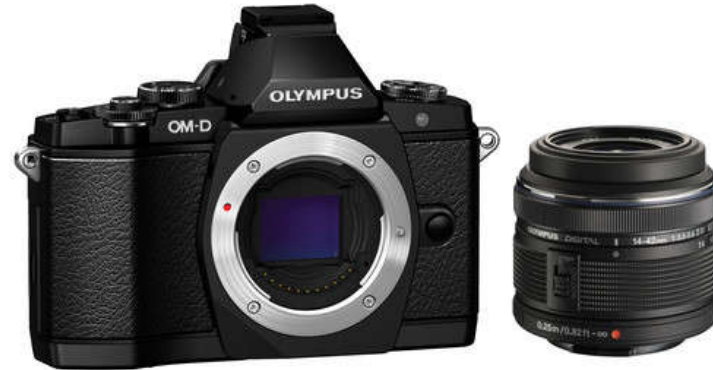
Olympus OM-D E-M5